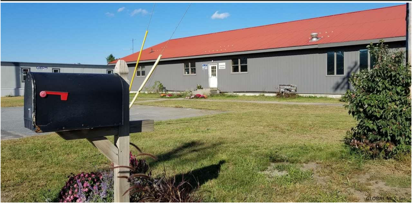
Listing courtesy of: Bryce Real Estate, Inc.