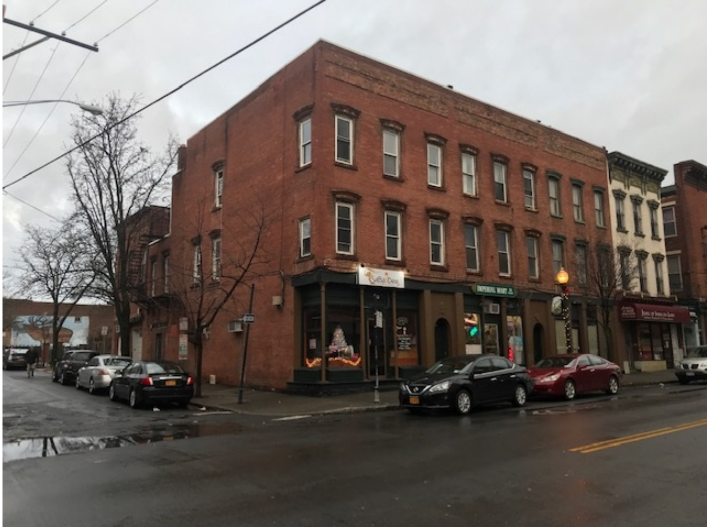
Listing courtesy of: Albany Realty Group, LLC