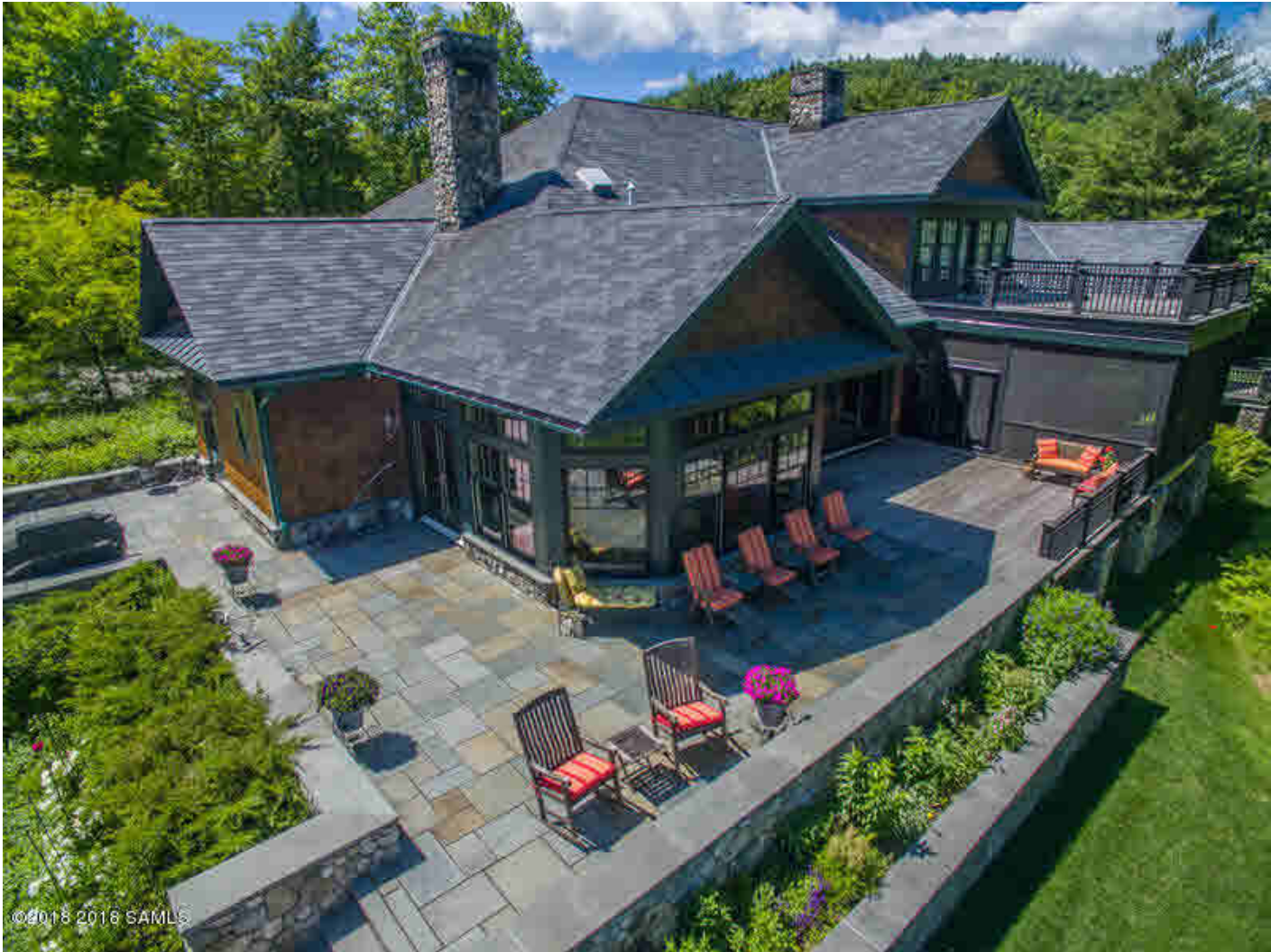
Listing courtesy of: Berkshire Hathaway HomeServices, Blake REALTORS(r)

PERSONALIZED GUIDANCE IN YOUR SEARCH FOR THE ADIRONACK DREAM - 518-494-2012